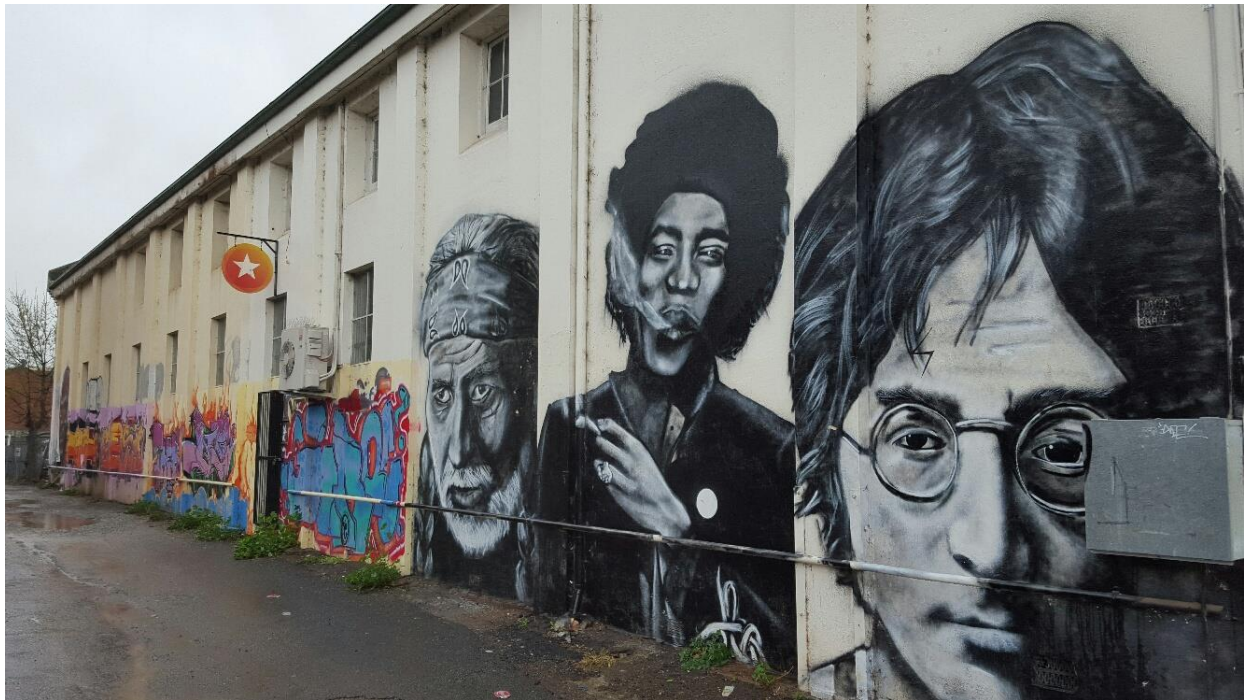
Commissioned art work on a privately owned building in Brisbane Street, Tamworth

Murals are a proactive strategy in minimising graffiti while also brightening up a dull area or wall. Business or commercial property owners can commission artists to have the mural designed in a way that promotes the business to the public.