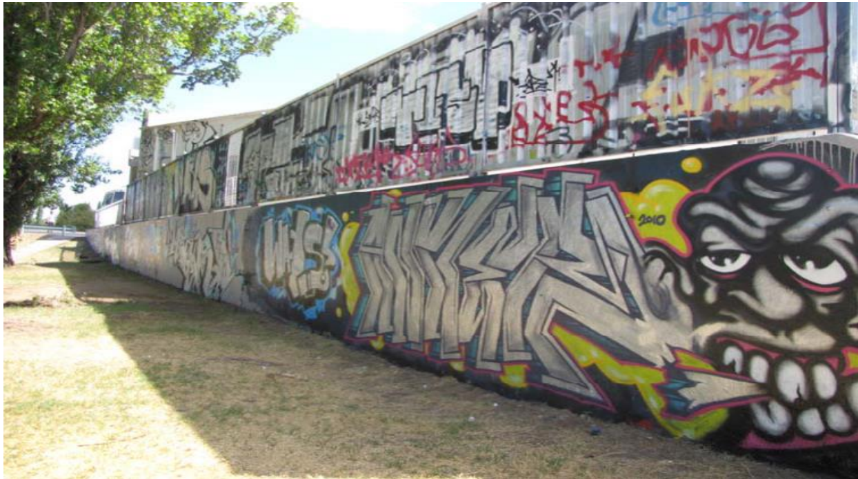
TRC's legal wall which is located adjacent to Solander Drive, Tamworth

Legal walls may deter graffiti incidents such as tagging by providing a legal outlet but only when the wall is maintained. Council aims to effectively manage existing and future legal walls.