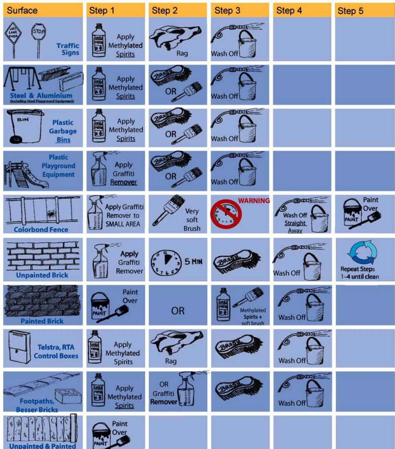
Chart developed by Blacktown City Council